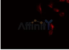
AF8337 staining HeLa by IF/ICC. The sample were fixed with PFA and permeabilized in 0.1% Triton X-100, then blocked in 10% serum for 45 minutes at 25°C. The primary Ab was diluted at 1/200 and incubated with the sample for 1 hour at 37°C. An Alexa Fluor 594 conjugated goat anti-rabbit IgG (H+L) Ab, diluted at 1/600, was used as the secondary Ab.

IMPORTANT: For western blot, incubate membrane with diluted Ab in 5% w/v milk, 1X TBS, 0.1% Tween@20 at 4°C with gentle shaking, overnight.